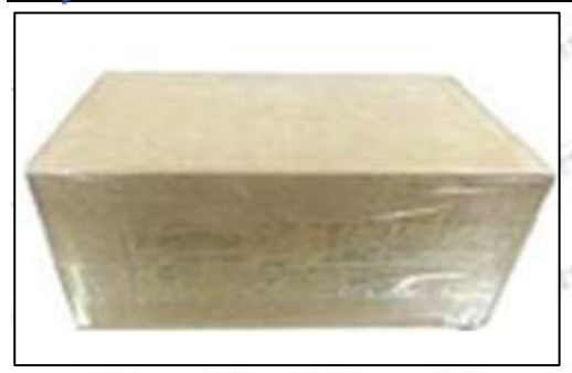
Pic No. 2 Domestic express packaging: Wrapped with Transparent tape