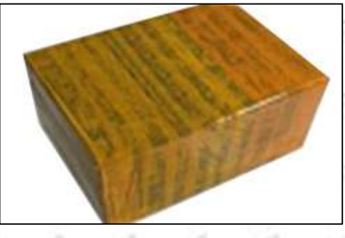
Pic No. 3 International express packaging: Wrapped with yellow tape after wrapping black protective film